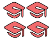
Four times as likely to graduate from college